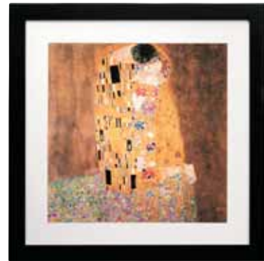
Artcool Frame Air Conditioner