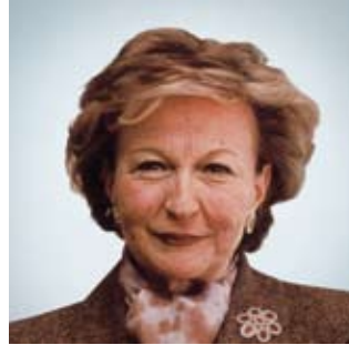
Suna Kıraç Vice Chairman

After graduating with a B.A. degree in Business Administration from George Washington University in 1984, he joined Koç Group in Tofaş. In 1992, he moved to Koç Holding and served as Vice President and President of various business groups. He became a Member of the Board of Directors in 2001 and Vice Chairman in 2002. He was appointed as Chairman of Koç Holding Board of Directors on 4 April 2003. He is a Member of Vehbi Koç Foundation Board of Directors, Board of Trustees of Turkish Volunteers for Education Foundation, Advisory Board of Kuwait International Bank, Rolls-Royce Advisory Board and JP Morgan International Council. He also serves as the Honorary Consul General of Finland for Istanbul.