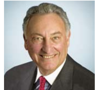
Sanford I. Weill Member