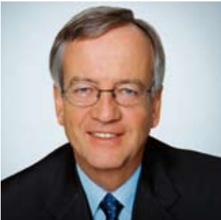
Prof. Dr. Heinrich V. Pierer Member

A graduate of City College of Business in London, he joined Koç Group in 1961. He served as General Manager of Tofaş Oto Ticaret A.Ş., Tofaş Group President and President of Automotive Companies prior to his appointment as Koç Holding CEO between 1994-1998. He has been a Member of Koç Holding Board of Directors since 1993. He has also been serving as the Chairman of the Board of Directors of Kıraç Group of Companies since 1998.