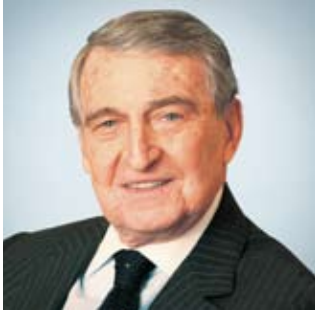
Rahmi M. Koç Honorary Chairman

A graduate of Johns Hopkins University in Business Administration, he joined Koç Group in 1958 at Otokoç and held various senior positions at Koç Holding. He became Chairman of the Management Committee in 1980 and was named Chairman of the Board of Directors of Koç Holding in 1984, a post he held until 2003 when he became the Honorary Chairman. He was the President of the International Chamber of Commerce between 1995-1996. In addition to his role as Koç Holding Honorary Chairman, Rahmi M. Koç also serves as Vice Chairman of the Board of Trustees of Vehbi Koç Foundation, Chairman of the Board of Trustees of Koç University, Founder and Chairman of the Board of Directors of Rahmi M. Koç Museum and Cultural Foundation, Chairman of the Board of Directors of Vehbi Koç Foundation American Hospital, Honorary Chairman and Founder of TURMEPA (Turkish Marine and Environment Protection Association), Honorary President of the High Advisory Council of Turkish Industrialists' and Businessmen's Association, Honorary Member of the Foreign Policy Association, Honorary Member of the NY Metropolitan Museum Board of Trustees and Member of Allianz AG International Advisory Board.