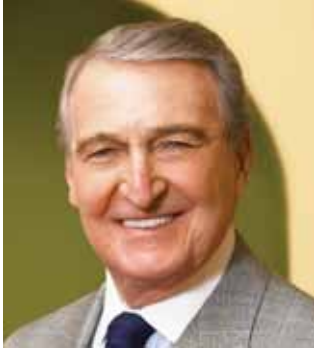
Rahmi M. Koç Honorary Chairman

A graduate of Johns Hopkins University in Business Administration, he joined Koç Group in 1958 at Otokoç and held various senior positions at Koç Holding. He became Chairman of the Management Committee in 1980 and was named Chairman of the Board of Directors of Koç Holding in 1984, a post he held until 2003 when he became the Honorary Chairman. In addition to his role as Koç Holding Honorary Chairman, Rahmi M. Koç also serves as Vice Chairman of the Board of Trustees of Vehbi Koç Foundation, Chairman of the Board of Trustees of Koç University, Founder and Chairman of the Board of Directors of Rahmi M. Koç Museum and Cultural Foundation, Chairman of the Board of Directors of Vehbi Koç Foundation American Hospital, Honorary Chairman and Founder of TURMEPA (Turkish Marine and Environment Protection Association), Honorary President of the High Advisory Council of Turkish Industrialists' and Businessmen's Association and Member of the Advisory Board of Turkish Employers' Association.