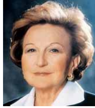
Suna Kıraç Vice Chairman

After graduating with a B.A. degree in Business Administration from George Washington University in 1984, he joined Koç Group in Tofaş. In 1992, he moved to Koç Holding and served as Vice President and President of various business groups. He became a Member of the Board of Directors in 2001 and Vice Chairman in 2002. He was appointed as Chairman of Koç Holding Board of Directors on 4 April 2003. He is a Member of Vehbi Koç Foundation Board of Directors, the Board of Trustees of Turkish Volunteers for Education Foundation and Istanbul Chamber of Industry. He also serves as the Honorary Consul General of Finland for Istanbul, Member of the Foreign Economic Relations Board, Advisory Board of Kuwait International Bank and Rolls-Royce Advisory Board. He joined JP Morgan International Council in June 2004. Mustafa V. Koç is also the Chairman of Turkish Industrialists' and Businessmen's Association High Advisory Council.