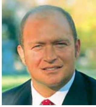
Mustafa V. Koç Chairman

A graduate of Johns Hopkins University in Business Administration, he joined Koç Group in 1958 at Otokoç and held various senior positions at Koç Holding. He became Chairman of the Management Committee in 1980 and was named Chairman of the Board of Directors of Koç Holding in 1984, a post he held until 2003 when he became the Honorary Chairman. In addition to his role as Koç Holding Honorary Chairman, Rahmi M. Koç also serves as Vice Chairman of the Board of Trustees of Vehbi Koç Foundation, Chairman of the Board of Trustees of Koç University, Founder and Chairman of the Board of Directors of Rahmi M. Koç Museum and Cultural Foundation, Chairman of the Board of Directors of Vehbi Koç Foundation American Hospital, Honorary Chairman and Founder of TURMEPA (Turkish Marine and Environment Protection Association), Honorary President of the High Advisory Council of Turkish Industrialists' and Businessmen's Association and Member of the Advisory Board of Turkish Employers' Association.